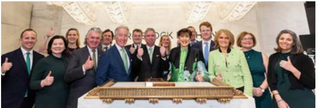
Pictured: Pictured at the New York Stock Exchange, Ireland INC, ringing the Opening Bell. The event took place at the 11th annual Ireland Day at the New York Stock Exchange where business and political leaders gathered to discuss Irish-US trade issues.